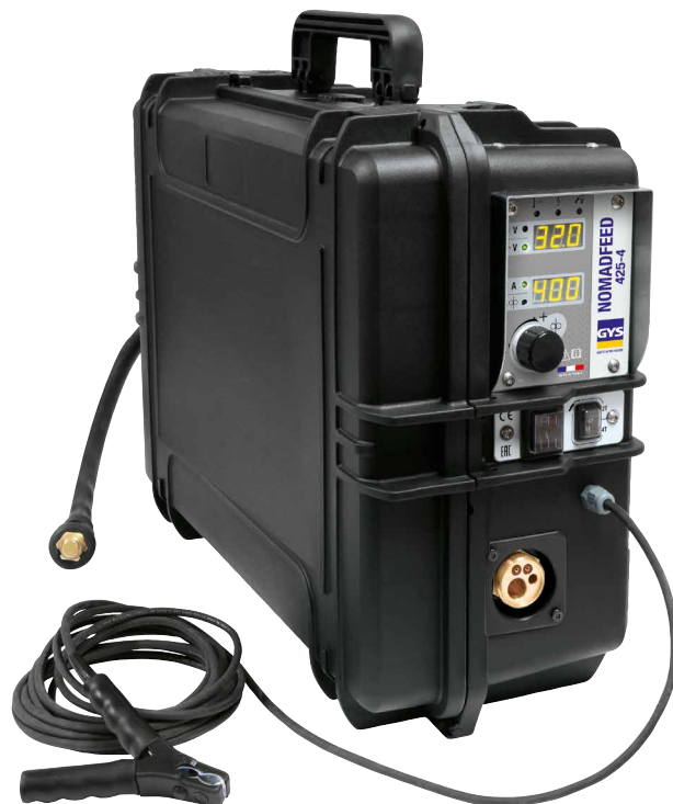
Supplied without accessories